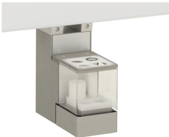
Figure 3: Vortex mixer.