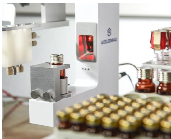
Figure 2: 2D barcode reader.