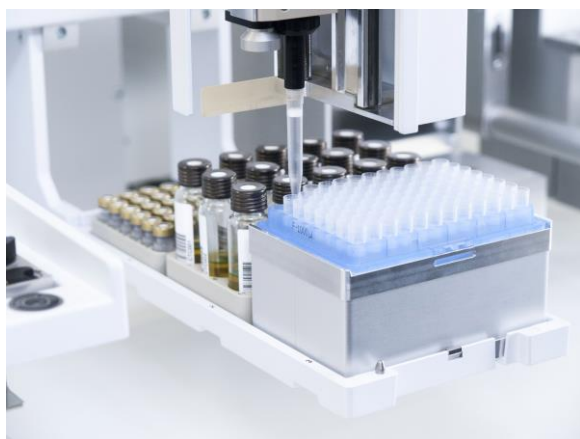
Figure 6: Pipette tips for the liquid handling of stock solutions.

A further requirement for a system for the preparation of calibration standards that works with highly concentrated standards is the prevention of carryover. In order to exclude any carryover, the CHRONECT Workstation MultiMix uses disposable pipette tips for dosing the stock solutions. These pipette tips are calibrated for the particular solvent used to achieve the target concentration of the analyte as accurately as possible. This calibration is carried out during installation and can be automated at any time by means of a supplied workflow in the control software.