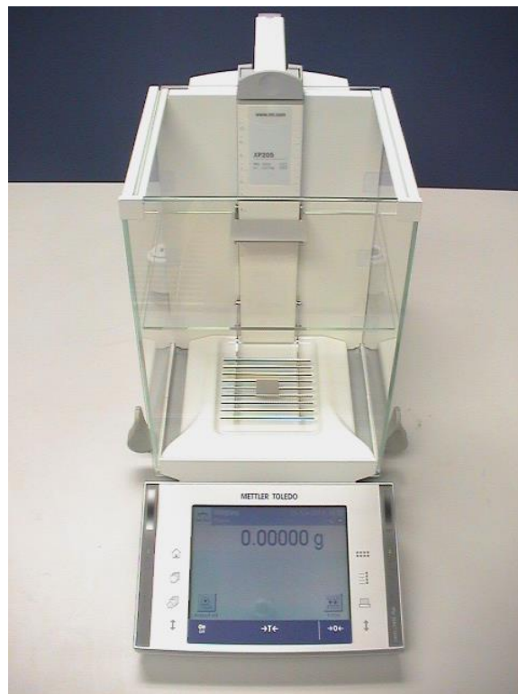
Figure 7: Balance for gravimetric control of the dosed volumes.

The actual concentrations obtained can be exported to calibration files for GC-MS or LC-MS data systems.