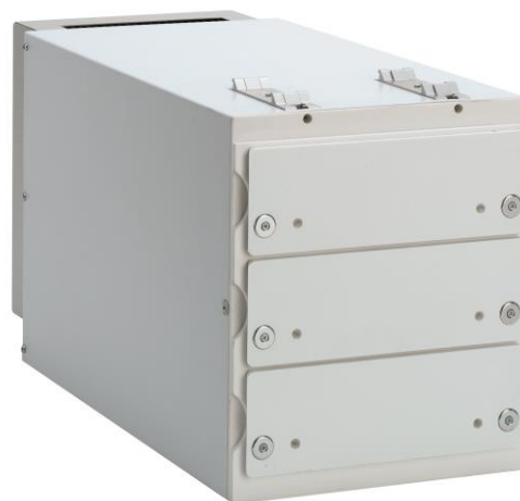
Figure 1: Cooled drawer system.